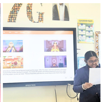
Polyglot Storytelling Literacy Day