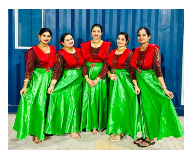
Teachers of LIS Dance Participation in ICC - Teachers' Day Celebration