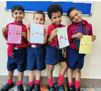
Felicitations by ICC, Tamil Sangha & Andra Kala Vedika