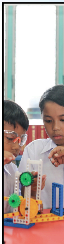
Glimpse of Activities