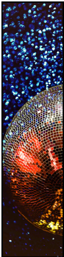
Avishkar- The Future Begins Here