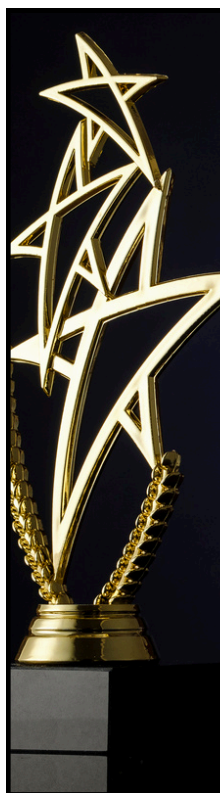
Student of the Month